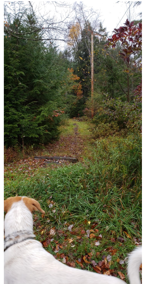
Several trails, replete with logs, mud and rocks, are visible from the road.