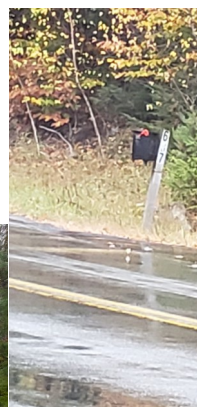
Looking across toward Big Bowman