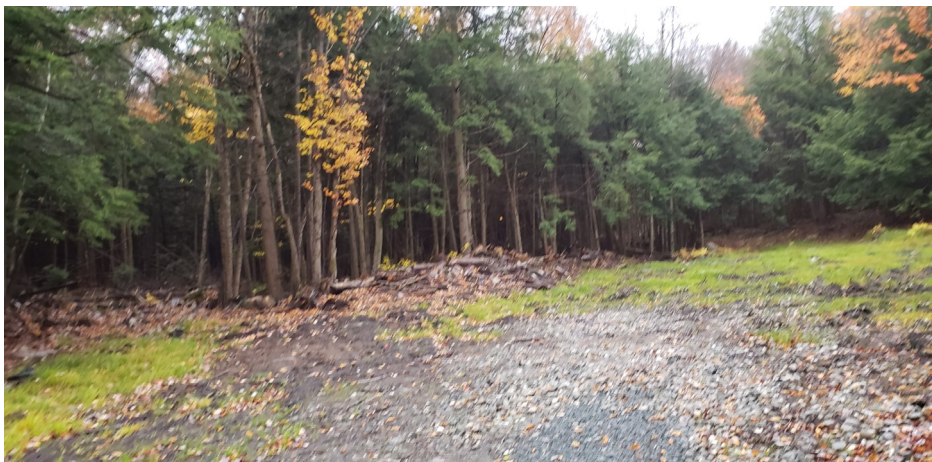
Looking into the lot from the road, remnants of the recent logging operations remain visible.

Keep an ear out for more discussions about the proposal and possible informational hikes led by RPA members. RPA is associated with several nature preserves, hiking and educational programs within easy reach of Taborton; RPA's website has full details.