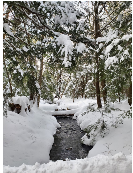
The Dam, Dec 19, 2020.