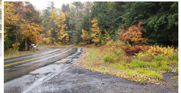
Looking up the mountain from the entrance