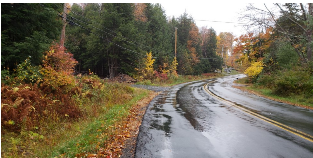
Looking down the mountain from the entrance