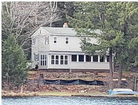
Now you see it ... now you don't.

safe distance from the construction and that parents keep a close eye on the many naturally-curious kids in our neighborhood. Winter Storm Gail did not help when she dumped a couple feet of snow from evening Dec 16 to afternoon Dec 17.i